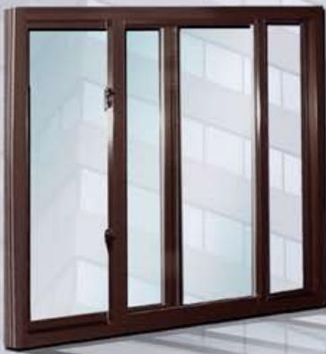
CTS - 2300 AAMA HS-C50 IGCC-CBA