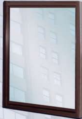
CTP - 2100 AAMA F-HC50 IGCC-CBA