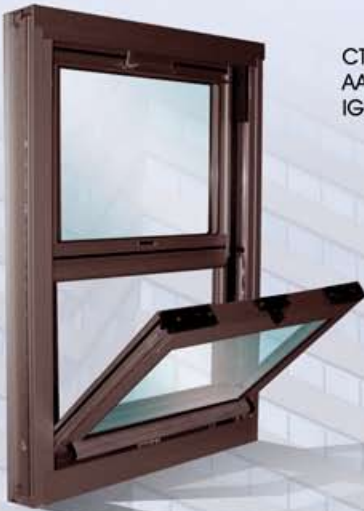
CTD - 2000A AAMA H-C60 / CW-PG50 IGCC-CBA